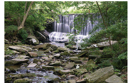
Waterfall in Susquehanna State Park