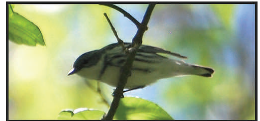
Cerulean Warbler, photograph by Kye Jenkins

The Cerulean may be close to earning the label "endangered," its numbers having tumbled dramatically since the 1960s, due to habitat destruction in its North American breeding territory and in its South American wintering grounds, so I was happy to find a number of them in the Patapsco area, more than expected. In the end I found 6 singing male Ceruleans—all of them likely breeders. (Plus two quiet, hard-to-spot females.) Who knows what the future holds. Hopefully they will be around for a long time.